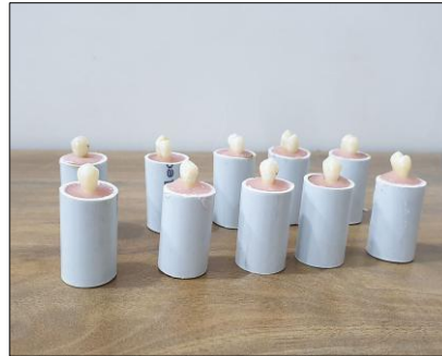
Figure (1): Samples before bracketing.

To exert force on the tooth-bracket interface in an occlusal-lingual direction, a knife-edge blade was employed. The load required to commence bracket failure or debonding was recorded in Newton units and subsequently converted to Megapascals (MPa). This conversion was achieved by dividing the failure load in Newton units by the standardized base surface area of the brackets, which measured 10.03 mm 2 , in accordance with the specifications provided by the manufacturing company.