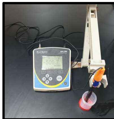
Figure (3): Fluoride analysis.