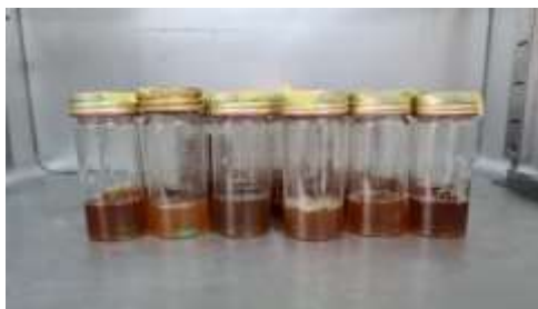
Figure (2): Sample with brain heart broth in an incubator after seven days of microwave sterilization.