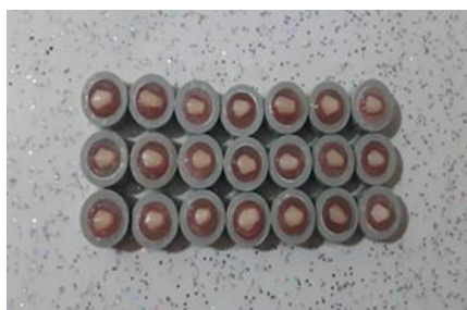
Figure (1): Teeth poured into the acrylic mold with a plastic ring.

The sample consists of 45 sound maxillary first permanent premolars collected from a private dental clinic in Erbil City. All teeth were cleaned with a cumine scaler, prophylaxis was performed using a rubber cup and non-fluoridated pumice, and the teeth were then preserved in a 0.1% thymol solution for two weeks. (13) Each tooth's crown is sectioned from its root at the cemento-enamel junction and then longitudinally sectioned with a diamond disk into 0.5 mm in thickness (14) , which is then measured using a digital caliper. The tooth is then embedded in an acrylic mold that is surrounded by a (16 mm diameter x 14 mm depth) plastic ring. (15) All enamel surfaces of samples are then covered with adhesive tape, except the middle circular 6 mm x 6 mm in diameter, which appears to polish it. Sof-Lex Disks were used to gently polish the buccal surfaces (3M ESPE, USA). (16) After polishing the enamel surfaces of all samples, the adhesive tape was removed to prevent an effect on the colorimeter test. As in Figure 1.