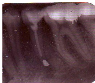
Radiograph 2; 1 month following surgery