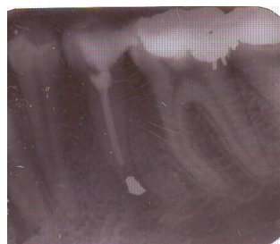
Radiograph 3; 6 month following surgery