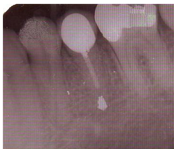
Radiograph 5; 2 years following surgery with post crown